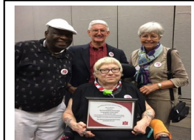
Members of the UUAA AIM Team during the EA Celebration