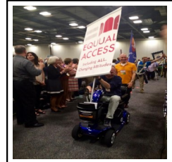
The EqUUal Access flag is carried in the Banner Parade.