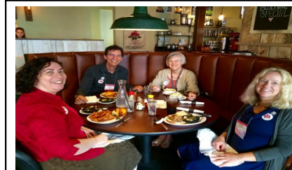
The Accessibility & Inclusion Ministry Team breaks for dinner